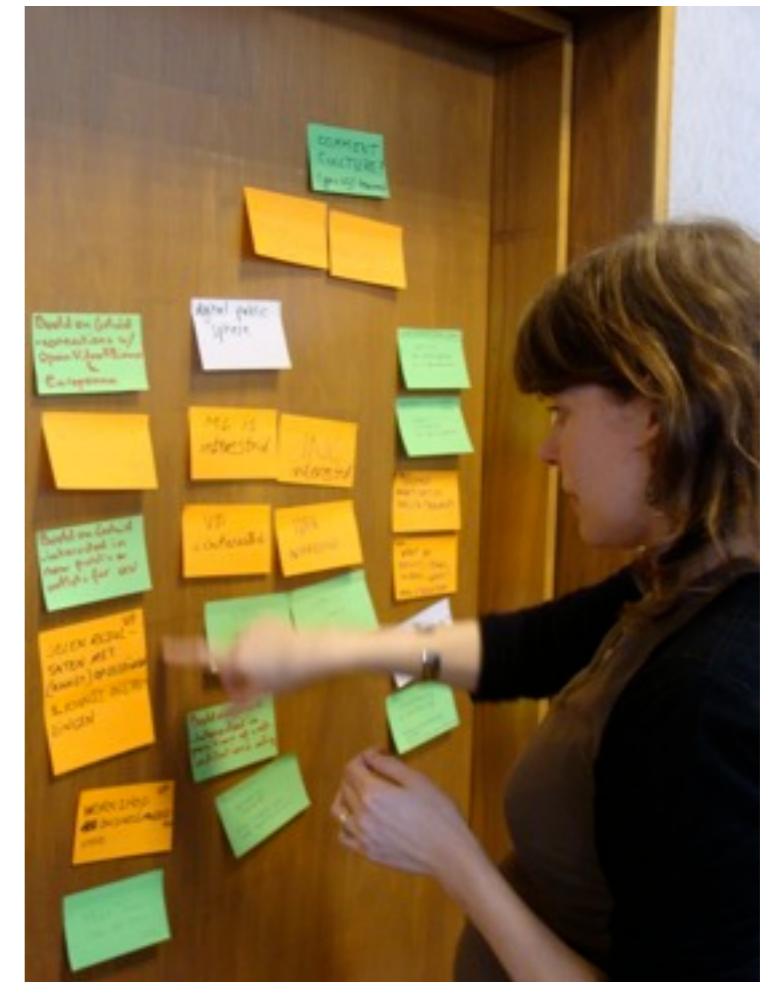
Digital Public Sphere