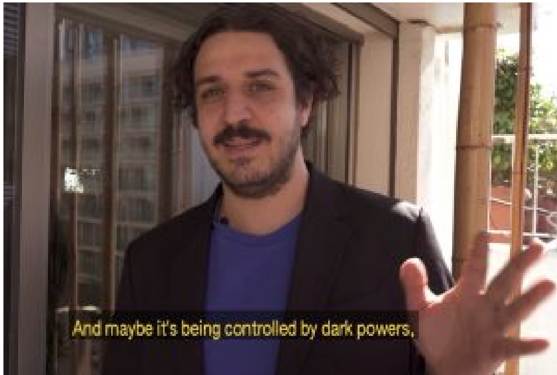
video still of the installation