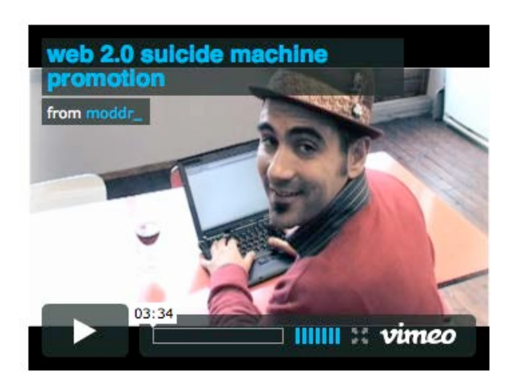
web 2.0 suicide machine promotion from moddr_ on Vimeo.

All in all, the Web 2.0 Suicide Machine was created as art project that aimed to disrupt the normalcy of the user's online life in social networks by deleting the user's account. It was designed for users that wondered how life would be without their online presence in social networks, for those who wondered how much free time they would have if they didn't bother with their online frenemies and "social" obligations. The core idea behind the Web 2.0 Suicide Machine was to enable users to 'unfriend' in an automated fashion and to raise awareness on privacy issues, letting users know that they should be in control of their own data.